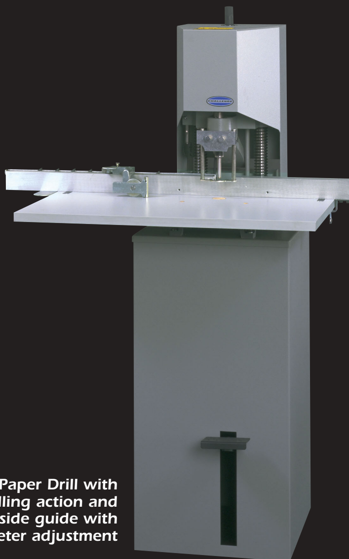
JF Model Paper Drill with foot pedal drilling action and automatic trip side guide with micrometer adjustment