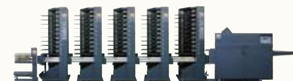
TD-d + BST10-d left + BST10-d add. + BST10-d add. + BST10-d add. + BST10-d main + BDF