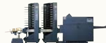
C/C mir. + BST10-d left + BST10-d main + BDF