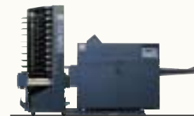
BST10-d main + BDF